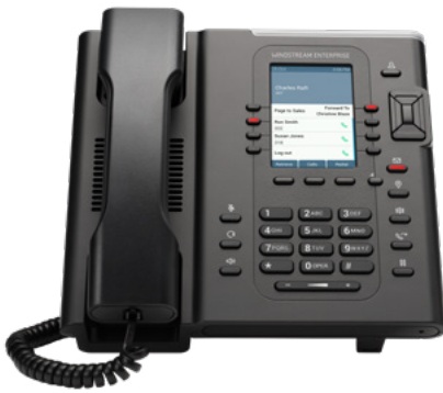
VERGE 9308-WE 8-KEY $0 per device

Optional contact center application that provides inbound calling, queuing, routing, recording and analytics