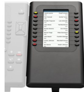
VERGE 9318-EXPANSION MODULE $1.50 per device

Contact your Windstream Enterprise representative for full details on how to qualify.